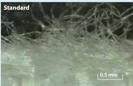
Belt edges after the impact of a defined force.

Frayfree belt types are particularly suitable for conveying packaged and unpackaged food, e.g. confectionery and baked goods and support you in implementing your HACCP concept.